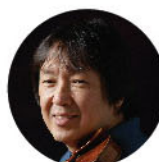
小提琴: 姜東錫 VIOLIN: DONG-SUK KANG