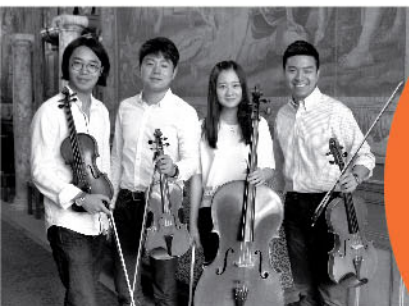
告士打弦樂四重奏 Gloucester String Quartet

Duration of the concert is approximately 1 hour, with no intermission.