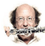
單簧管: 勒蒂耶克 CLARINET: MICHEL LETHIEC

「寶璣卓越慶典」音樂會冠名贊助 BREGUET'S CELEBRATION OF EXCELLENCE CONCERTS TITLE SPONSOR