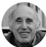
鋼琴: 卡尼諾 PIANO: BRUNO CANINO